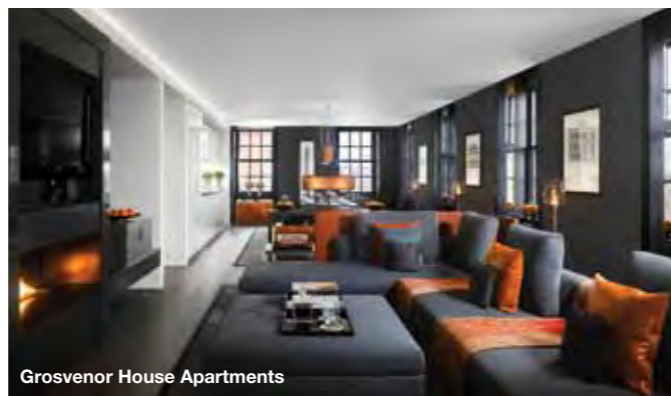
Grosvenor House Apartments