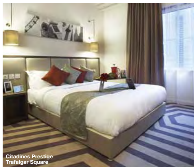
Citadines Prestige Trafalgar Square

Ascott has been rolling out a brand-wide refurbishment of its European Citadines properties over the past two years, and both the Citadines Prestige South Kensington and Citadines Prestige Holborn-Covent Garden benefited from extensive renovations in 2010.